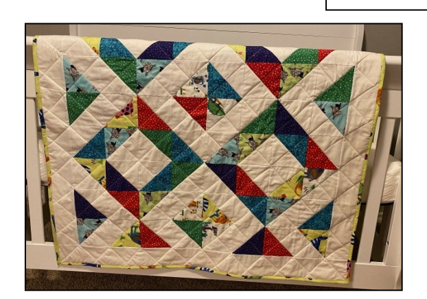
#1a: Amy Bunch